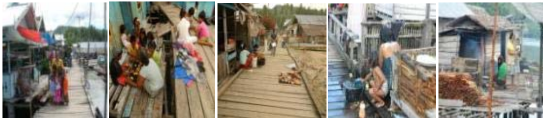
Figure 6 : A variety of activities on " Tetean " in the vernacular settlements of coastal aquatic (Field Data, 2011, update data 2012, 2013)