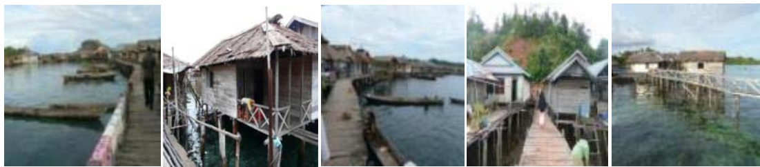
Figure 3 : "Tetean" as access to the coastal vernacular settlements (Field Data, 2010, update data 2011, 2012)

Tetean are made of the wood and use the wooden poles that plug into the water (sea). Limitations the land on the mainland so that tetean settlement is an alternative to connecting facility the settlements. Tetean do not only as access, connecting the residential spaces, the boat moorings / boat, but the multi function spaces, where spaces 'tetean' be used as spaces daily activity that is playing settlers, gathering spaces, event space (circumcision, marriage, school ceremonies, etc.), spaces to work and earn a living. Tetean are also be used as an excellent drying space marine products and other needs. These activities supporting the cultural life of coastal communities. The local culture of coastal communities very important role in the establishment of settlements, especially in the form, structure the settlement and the environment as well as supporting elements.