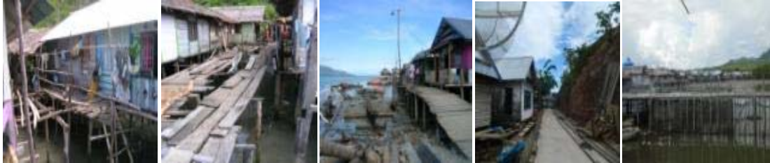
Figure 5 : " Tetean " as access to the coastal vernacular settlements (Field Data, 2011, update data 2012)