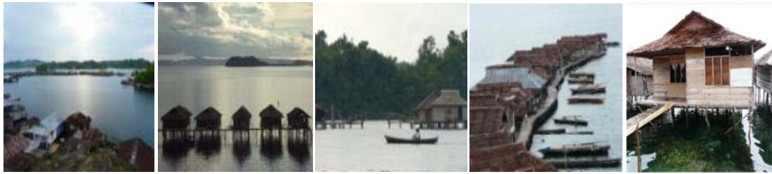
Figure 2: "Tetean" as the vernacular settlements access to the coastal aquatic (Field Data, 2010, update data 2011, 2012)